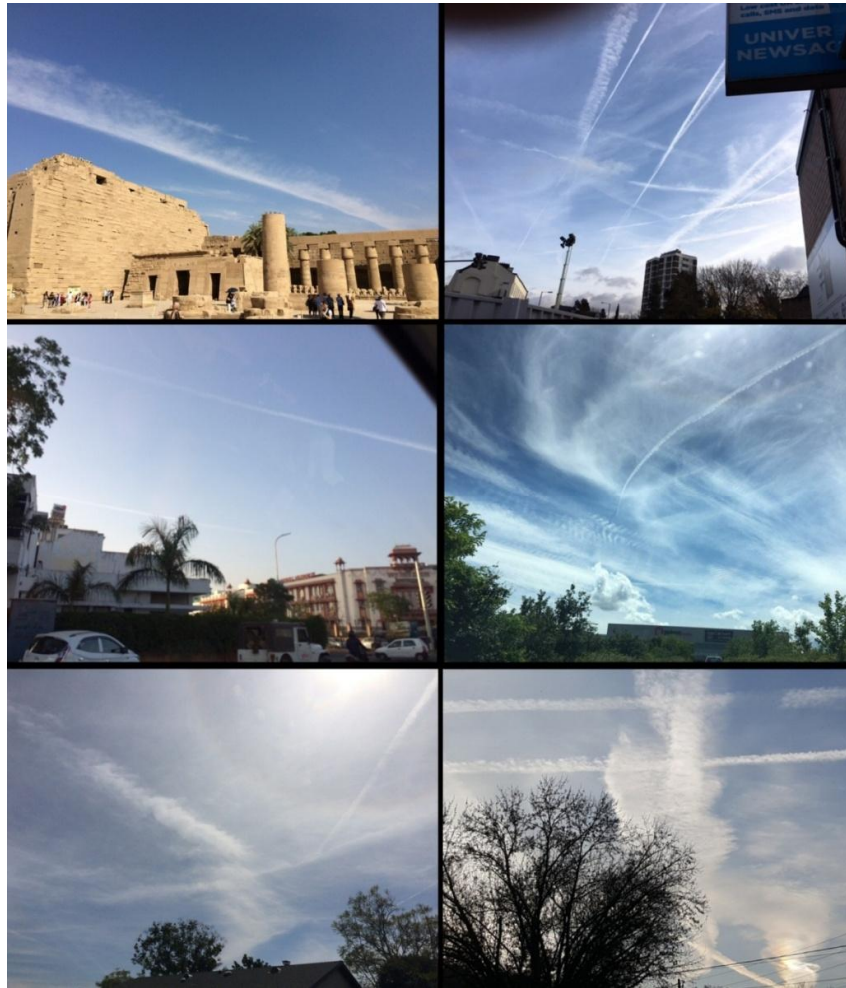
Fig. 1. Jet-emplaced weather/climate manipulation particulate trails. (Photographers with permission) Clockwise from upper left: Karnak, Egypt (author JMH); London, England (Ian Baldwin); Geneva, Switzerland (Beatrice Wright); Chattanooga, TN, USA (David Tulis); San Diego, CA, USA (author JMH); Jaipur, India (author JMH)

heat from leaving Earth's surface. The aerosolized particles inhibit rainfall by keeping water droplets from coalescing to fall as rain; the effect is to cause drought, but eventually, the atmosphere becomes so burdened with moisture that storms occur with rain falling in deluges. This covert aerial spraying worsens global warming and totally disrupts natural weather patterns [19].